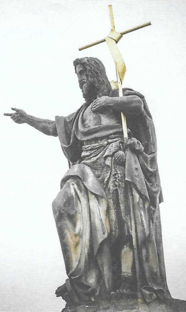
Statue of St John the Baptist on the north side of Charles Bridge, one of the most famous tourist spots in Prague

REJOICE — THE LORD IS NEAR! (JOHN 1:6-8. 19-28)