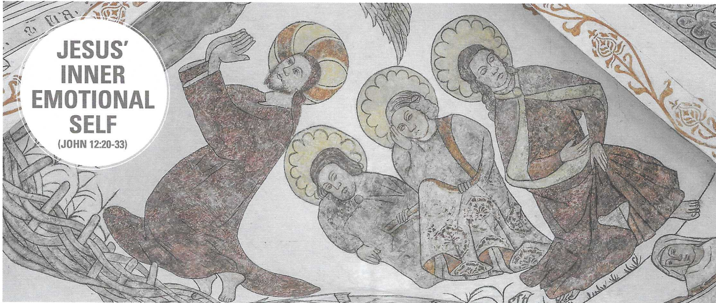
"Agony in the Garden", a wall-painting from about the year 1500, in the Church of St Mary, Elsinore, Denmark

When he is told that "some Greeks", who have come to Jerusalem for the festival of Passover, want to see him, Jesus tells his disciples that "the hour" for him to be glorified has arrived. The period of his revealing his glory, which began with the first sign at Cana and ended with the final one of the raising of Lazarus, is over, and his passion is about to begin.