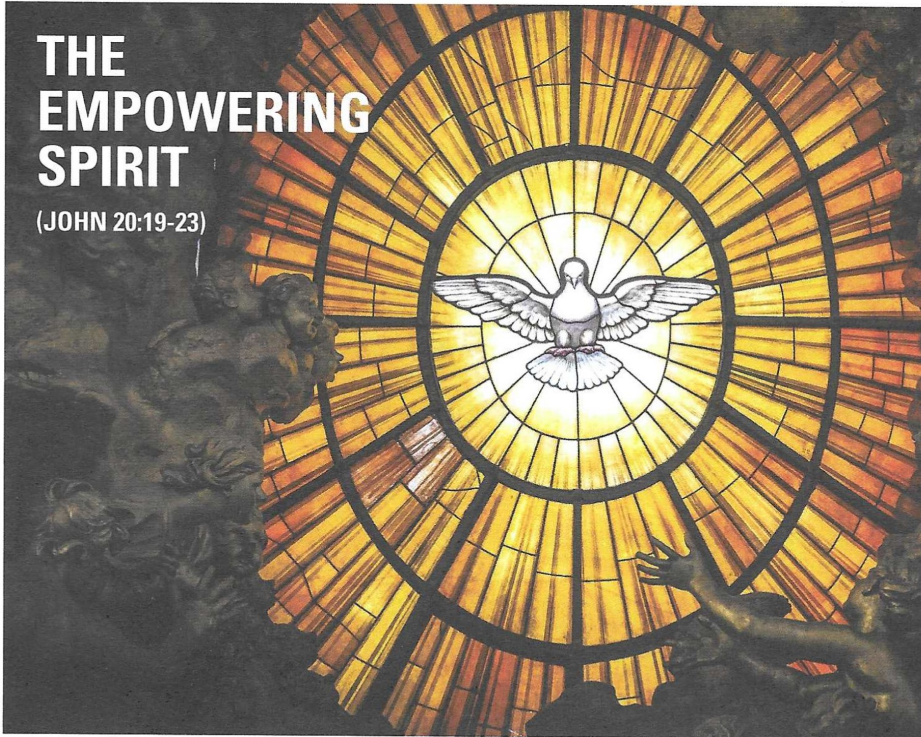
"Dove of the Holy Spirit" at Throne of St Peter by Bernini (1600s) in St Peter's Basilica, Rome

The miraculous appearance of Jesus among the disciples in a locked room shows that he is no longer constrained by physical limitations.