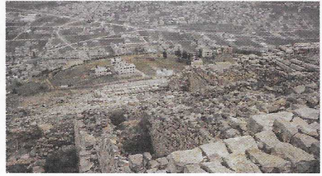
The ruin of Mount Gerizim

They built a rival temple to that of Jerusalem on Mount Gerizim: this underlies Jesus’ conversation with the woman at the well in the Gospel of John.